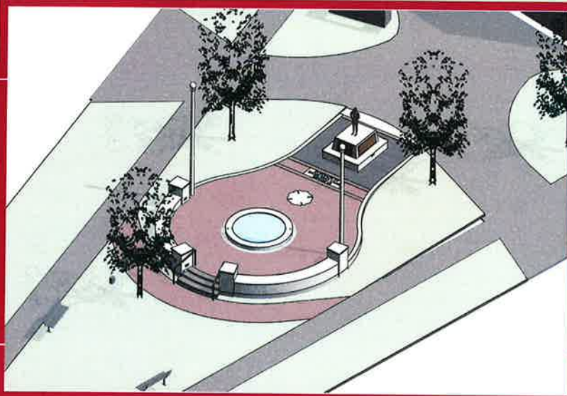
The Memorial will consist of a fountain, curved seating walls, 4x8 & 16x16 paver bricks, a Maltese cross cast in stone and an eight and a half foot tall bronze firefighter statue

A memorial that honors past, present and future firefighters